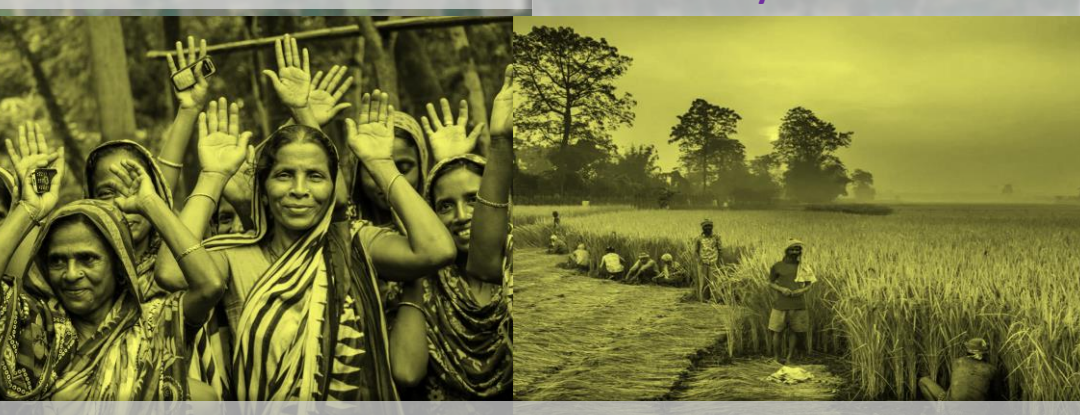
Intellecap provides end-to-end carbon solutions covering demand-side, supply-side and ecosystem level

Access to 2mn+ low- and middle-income households, 1 mn+ farmers and 5k+ MSMEs